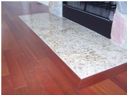
Brazilian cherry & tile surround.