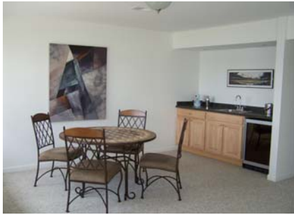
Rec Rm with wet bar.