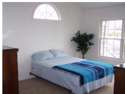
Dual lakeside master bedrooms.