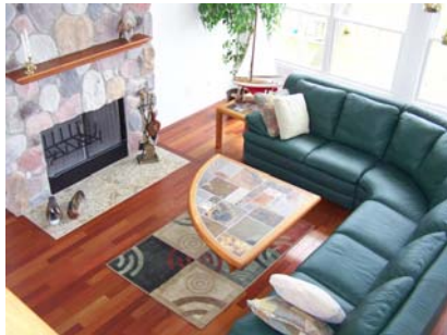
Living room fireplace & dining.