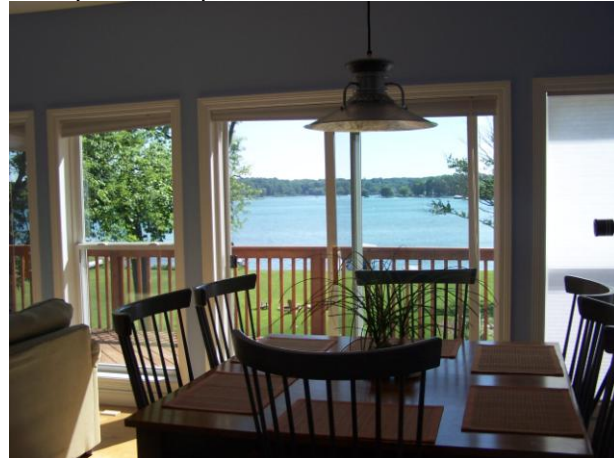
Just look at that water!