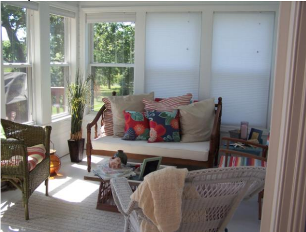
Sun rooms don't get any better than this one!