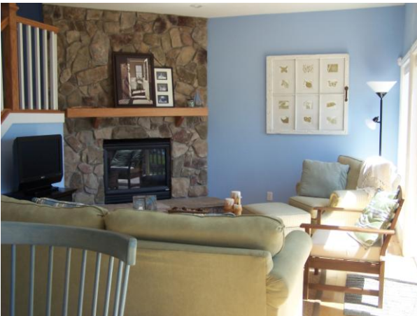
Gas log fireplace.