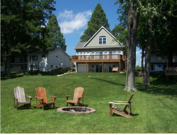
Pick your chair out now!