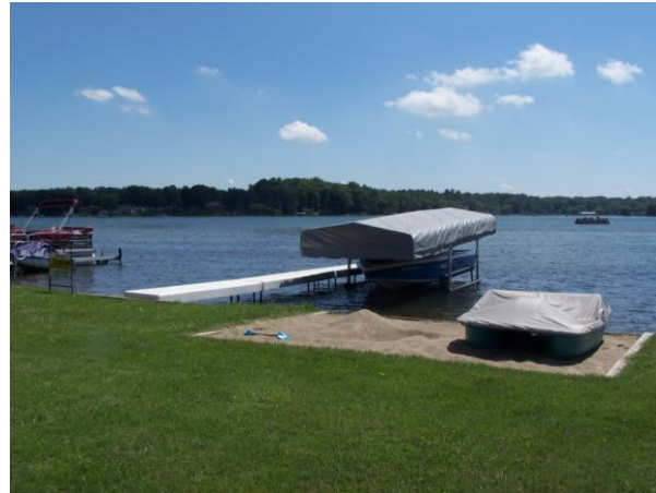
Sandy Beach & pier & boat lift included.