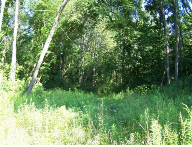
Beautiful mature hardwoods.