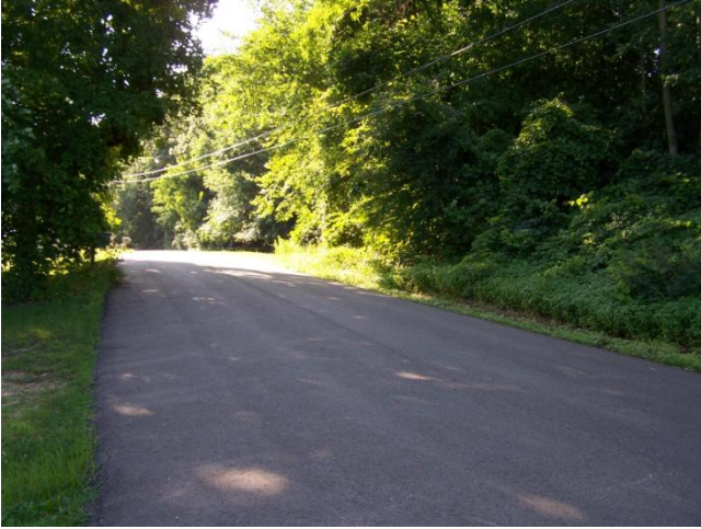
Lakeshore Drive area.